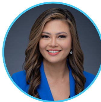
Rep. Trish La Chica